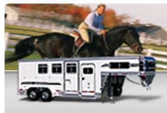
Eby Trailer Manufacturing Plant