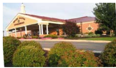
Shady Maple Restaurant